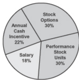
Target Total Direct Compensation Chief Executive Officer

Variable Performance-Based Compensation = 82%